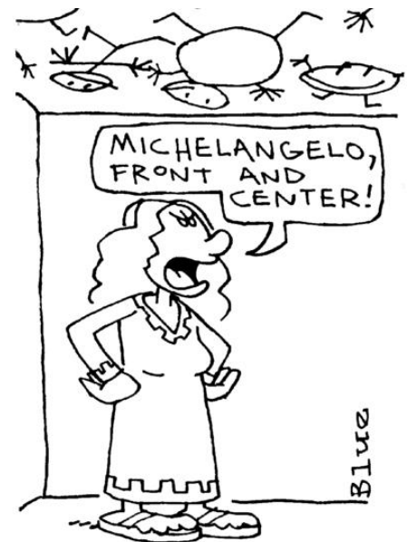
Reprinted from The Funny Times / PO Box 18530 / Cleveland Heights, OH 44118 phone: (216) 371-8600 / e-mail: tr@funnytimes.com