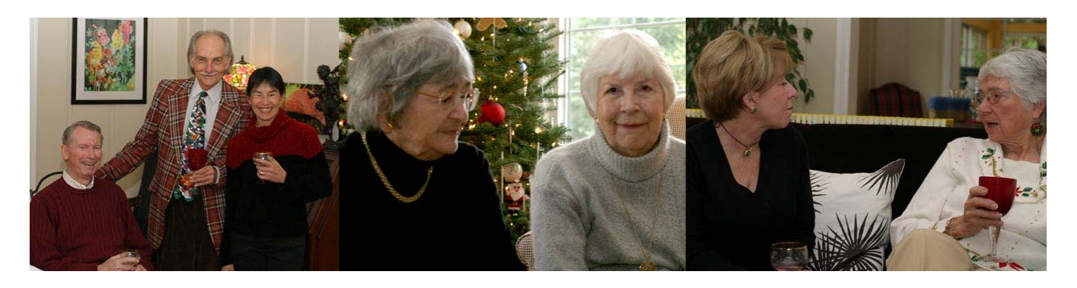
Faces of the 2006 Oakland Art Association Holiday Party