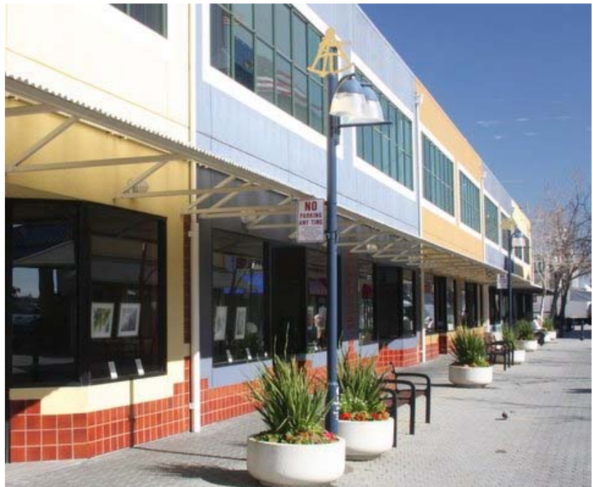
OAA Jack London Square Show