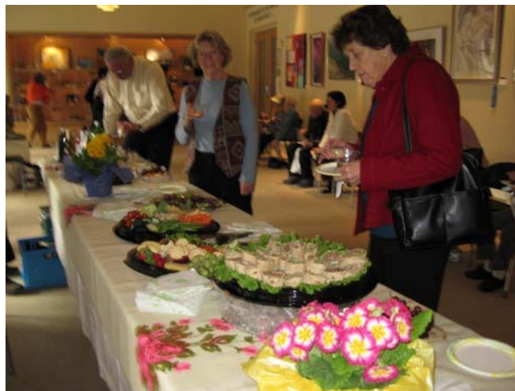
OAA Reception February 7th at the Orinda Library