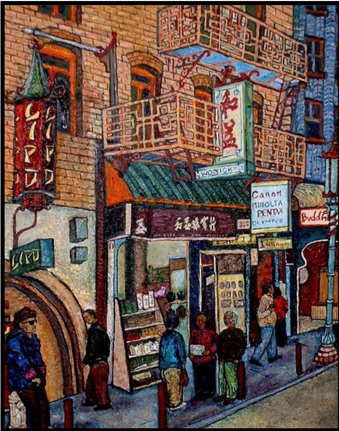
"The Place to be"

I am delighted to have been given such a special opportunity.